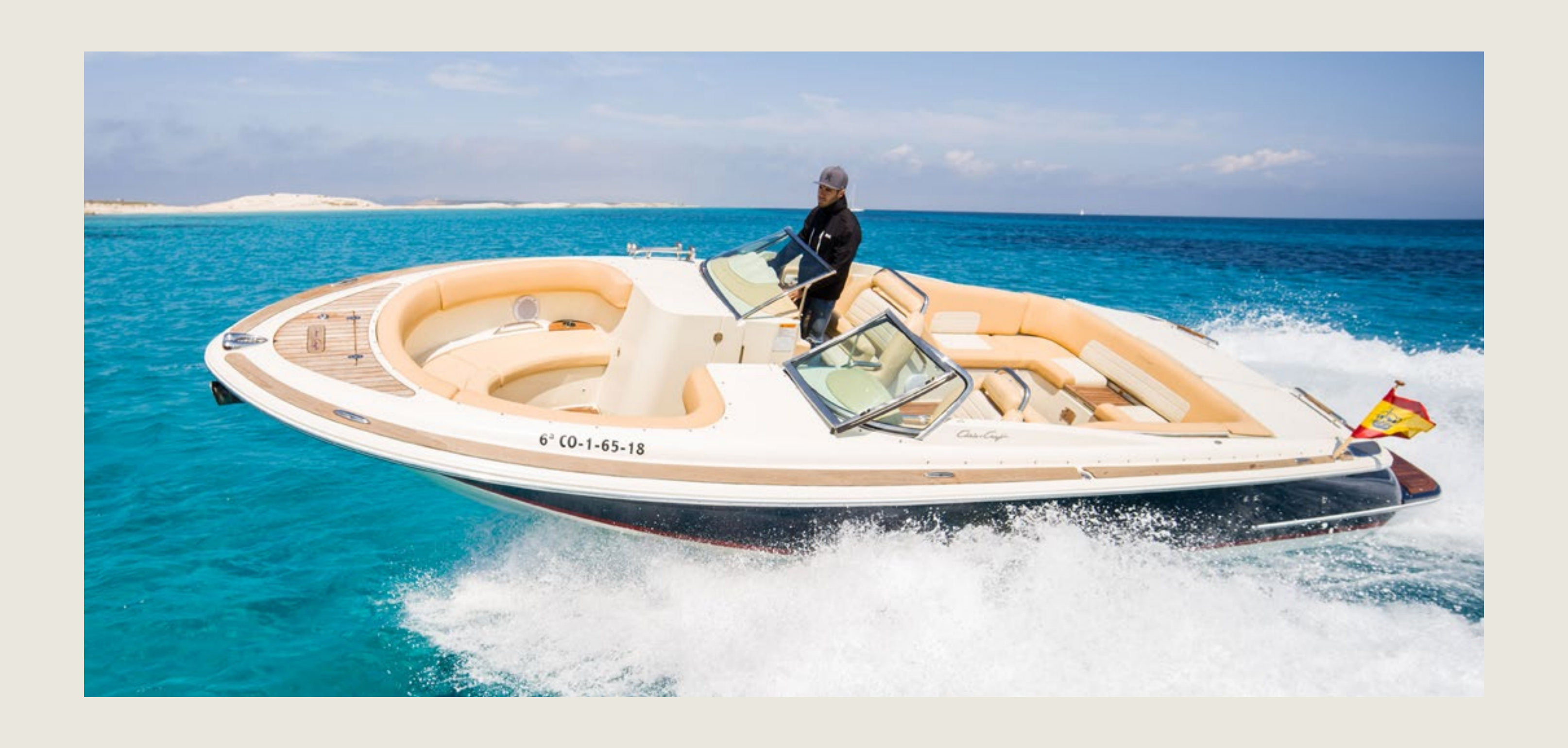
CHRIS-CRAFT 28 007