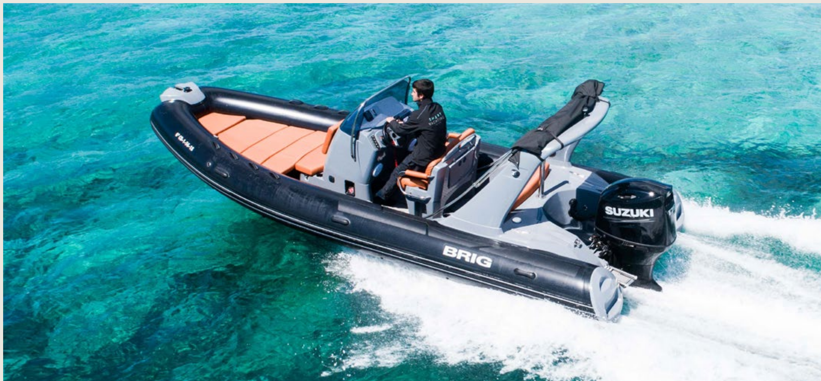
BRIG 650 SPEEDY GONZALEZ