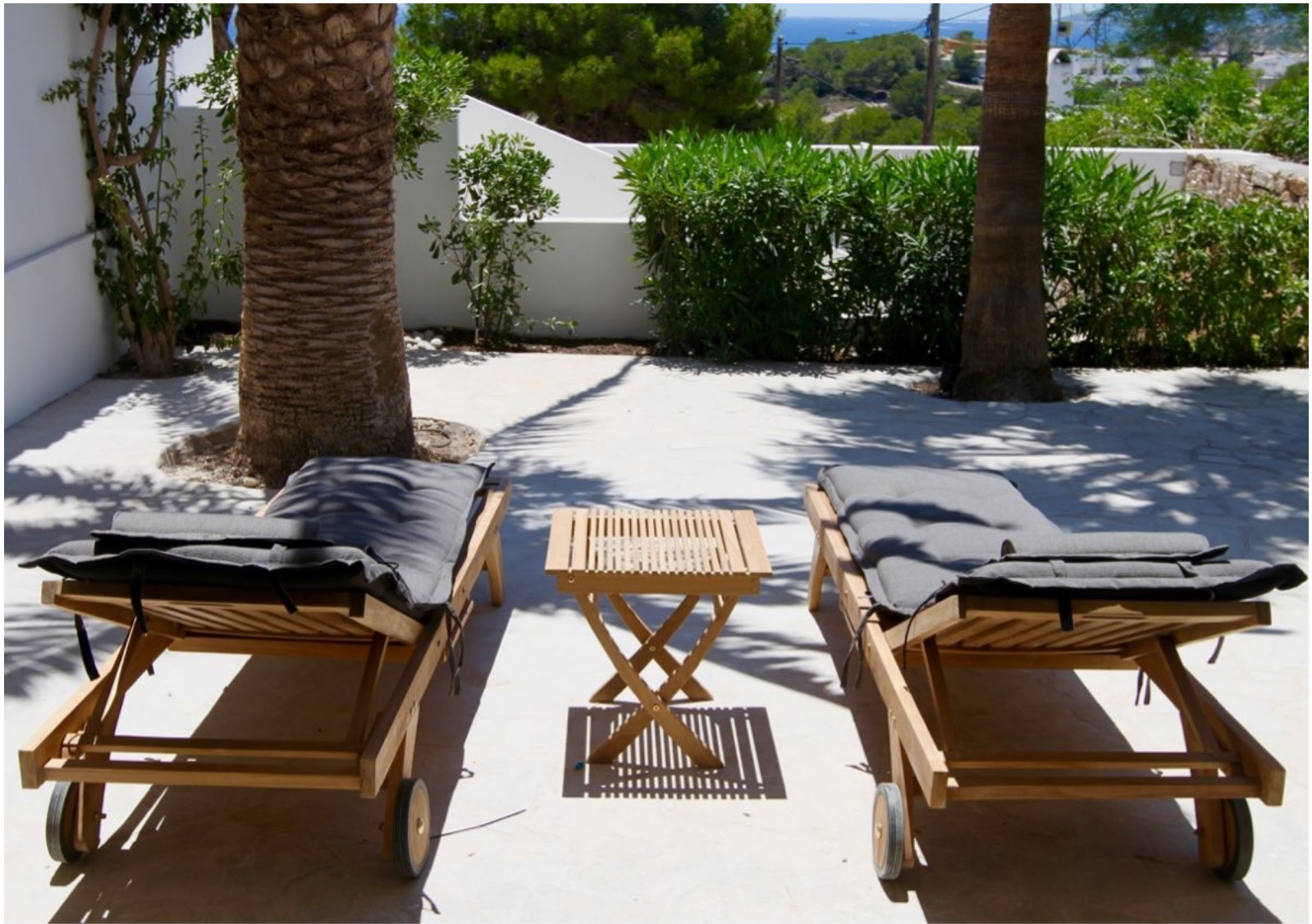
Villa Martinet - Cap Martinet