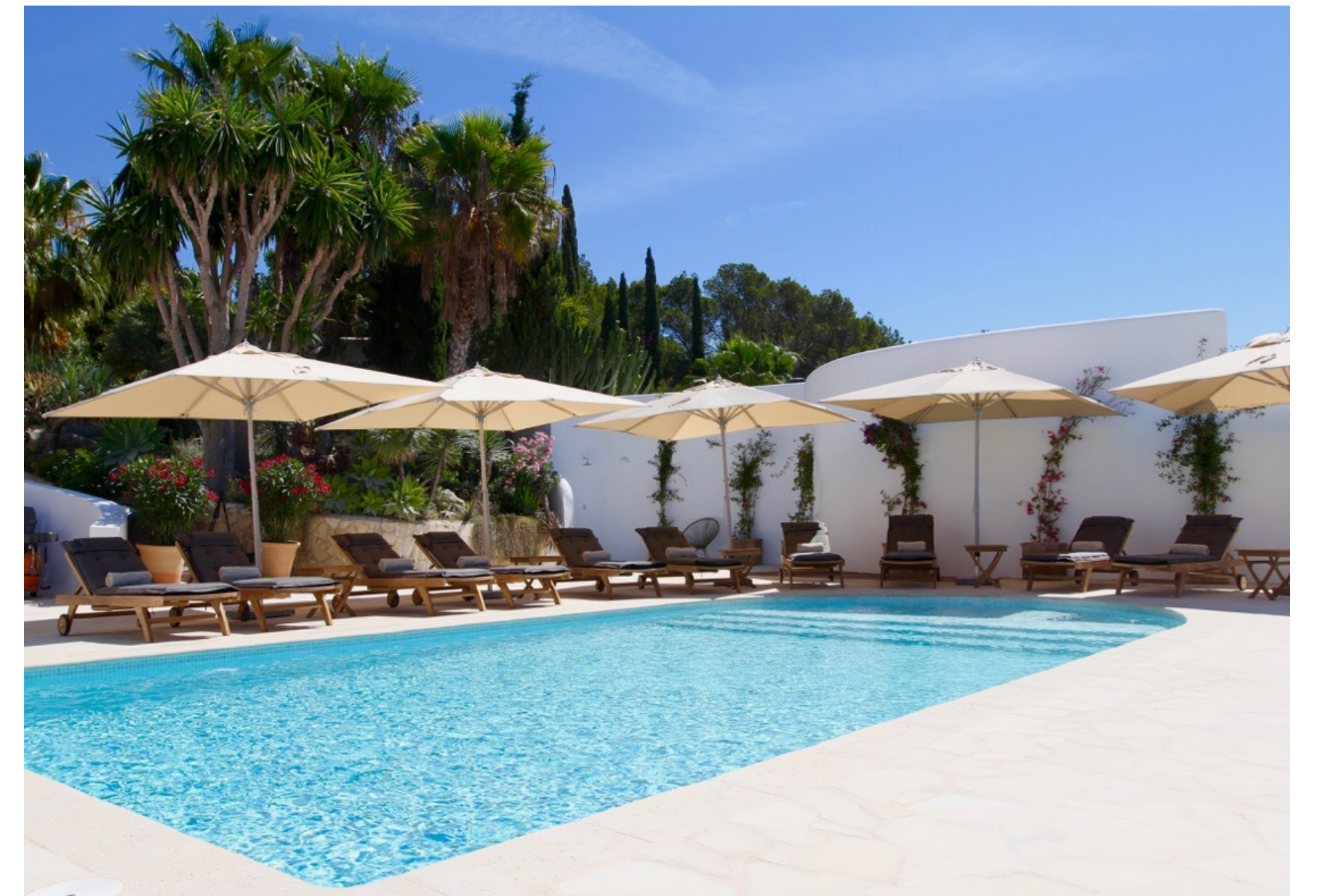
Villa Martinet - Cap Martinet