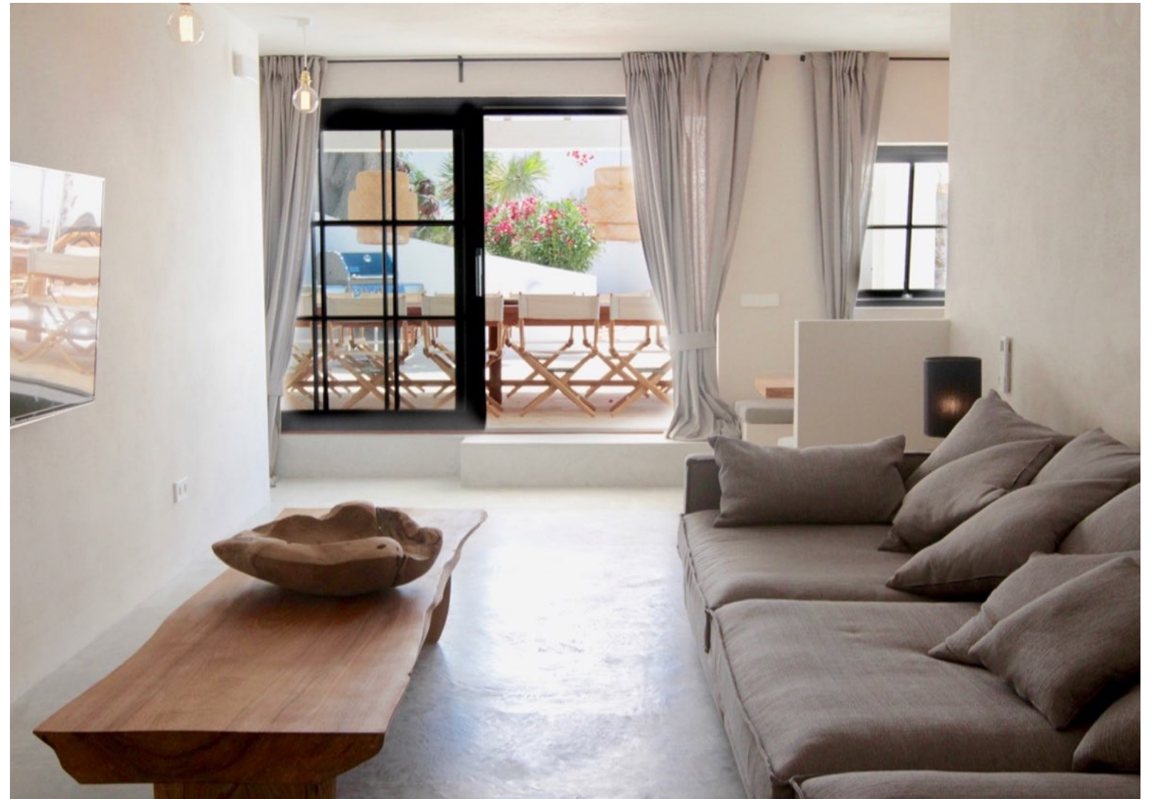
Villa Martinet - Cap Martinet