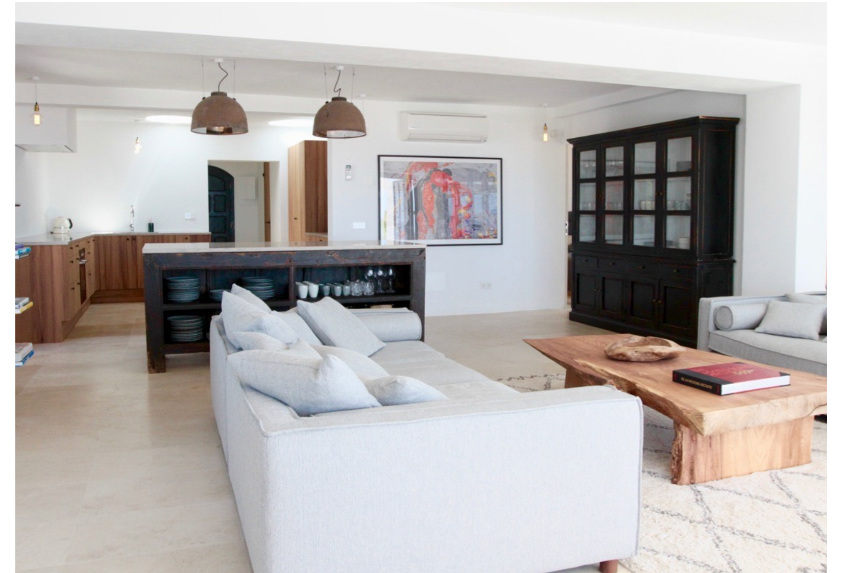
Villa Martinet - Cap Martinet