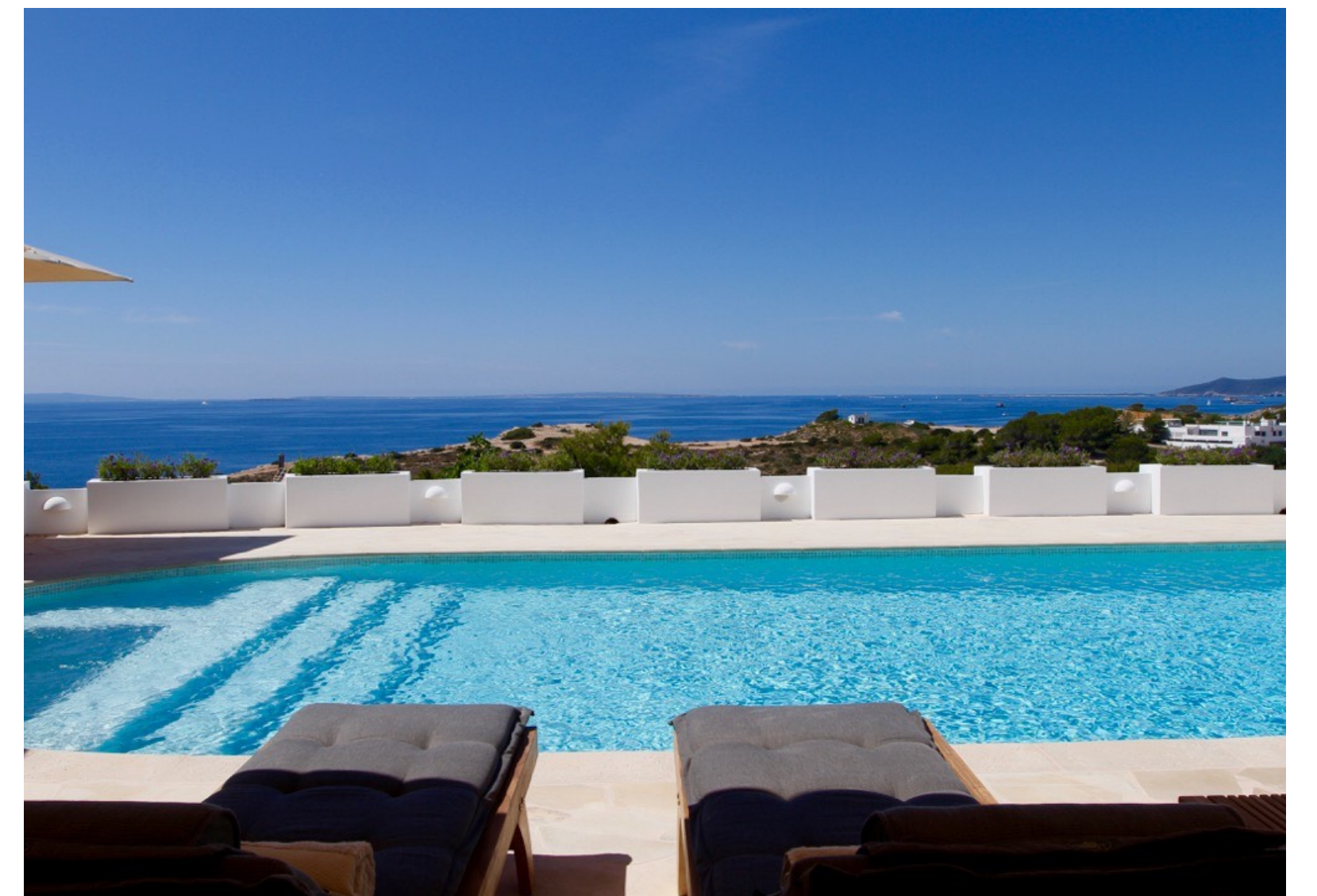
Villa Martinet - Cap Martinet