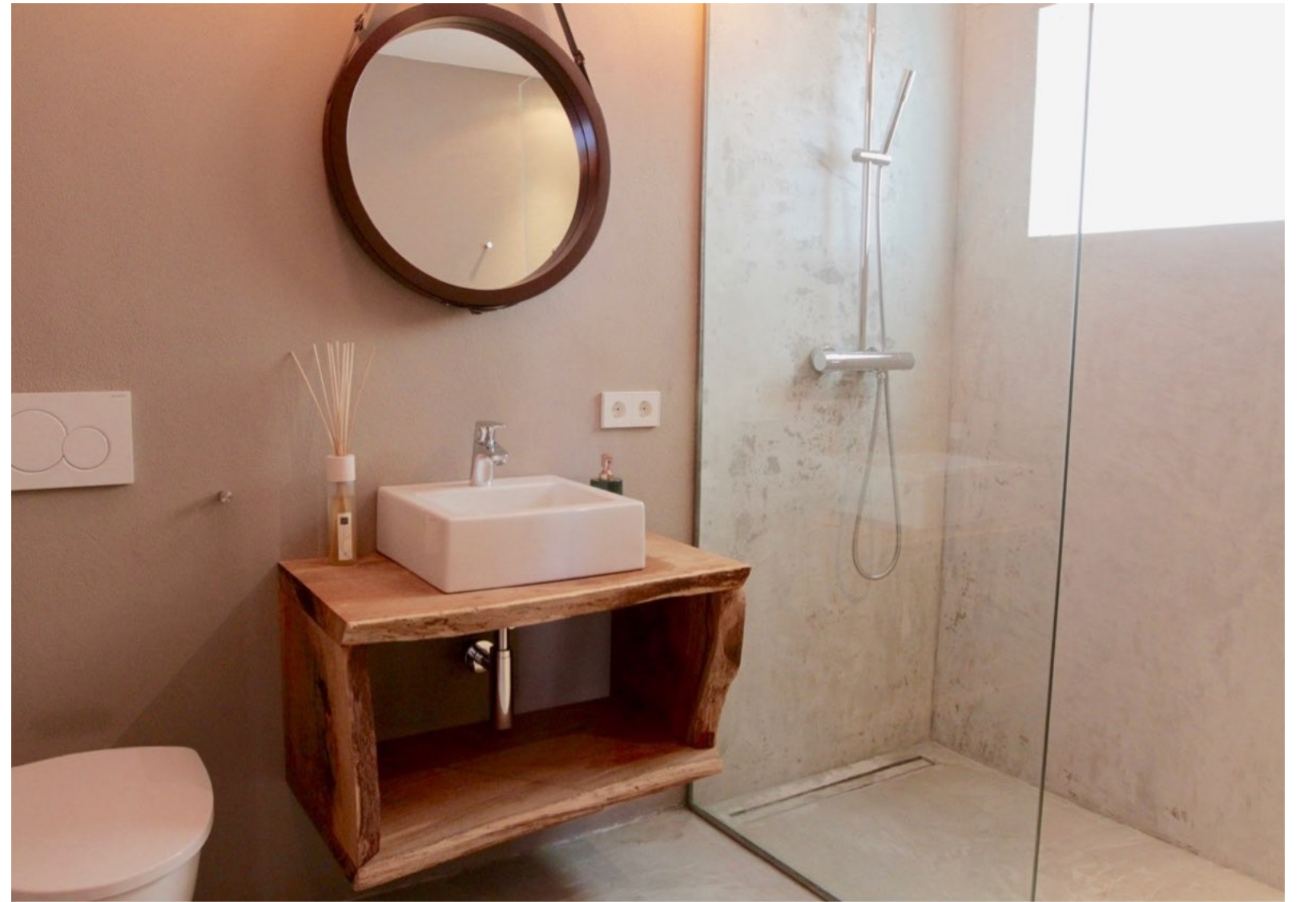
Villa Martinet - Cap Martinet