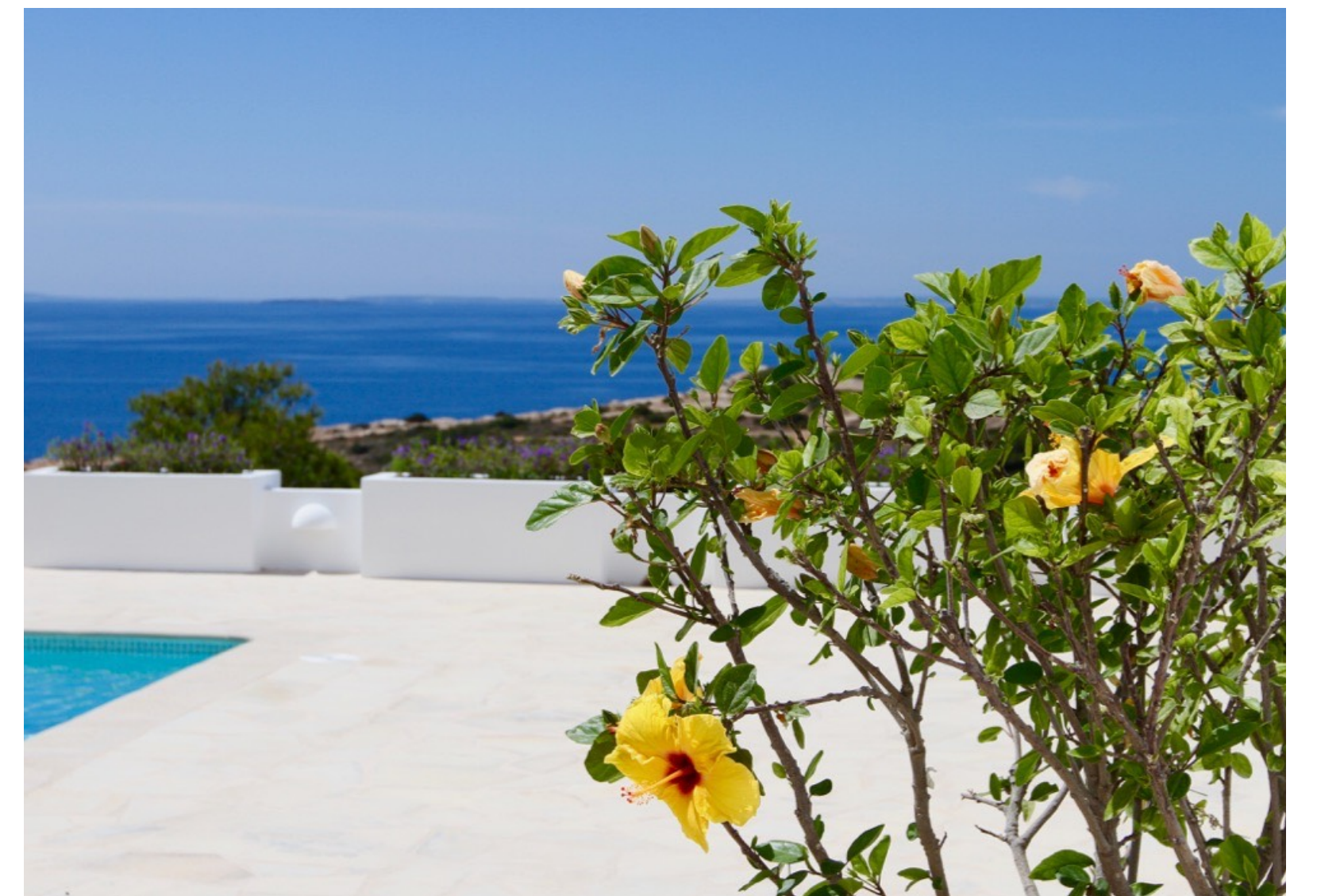
Villa Martinet - Cap Martinet