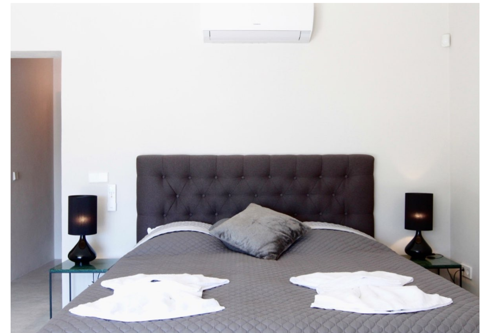
Villa Martinet - Cap Martinet