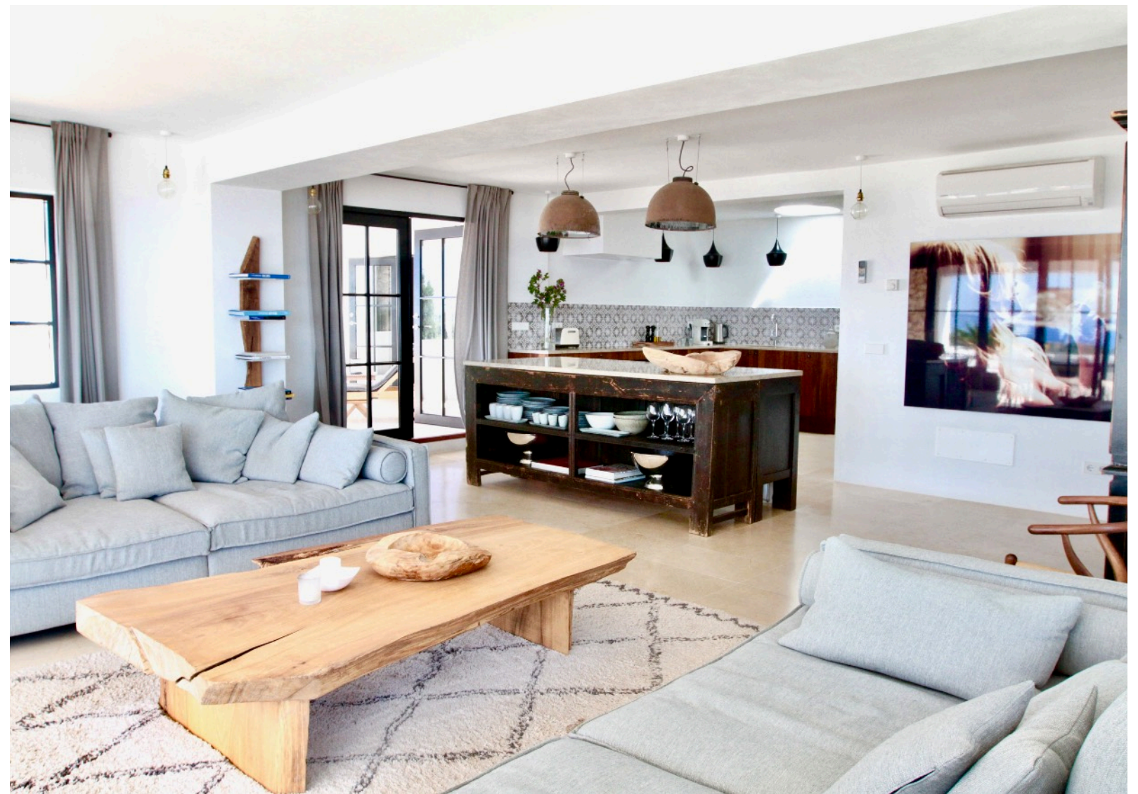
Villa Martinet - Cap Martinet